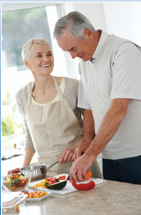
A McCaleb Homes Community